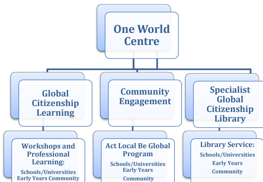
Figure 1 Work Chart

Objective Four: Develop OWC's capacity to be a vibrant, agile, well-connected and financially viable organisation that supports active global citizenship.