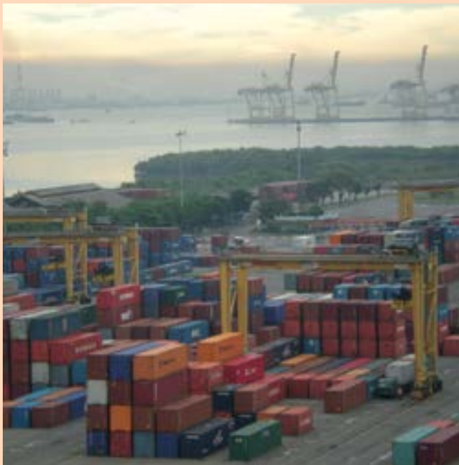
The container port in Surabaya, Indonesia.

Trade is the action of buying and selling goods between people, organisations and countries. Healthy international trade can provide people with jobs and money that they didn't have before, or new skills and ideas. Therefore it is worth knowing about the many ways countries can work together through trade to improve the lives of their most vulnerable citizens.