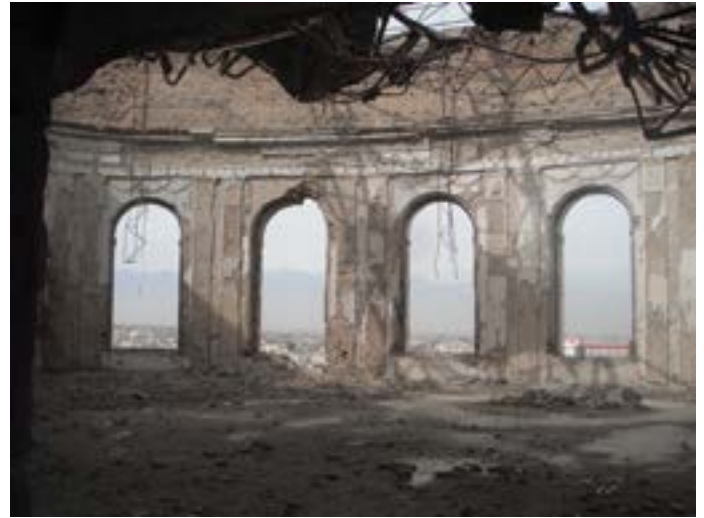
Darul Aman Palace, Kabul, left in ruins after the 1990s civil war.

Make a large circle again and ask one group to choose another group whose cause is related to theirs. Then one group member holds one end of a piece of wool while another takes it over to the other group and gives it to them to hold. Go around the whole class asking each group to connect up with another with a piece of wool, giving each group three turns. Stop a few times during the activity to remind students of the range of causes written on the cards.