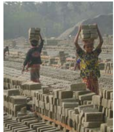
Children working in a brick field in southern Bangladesh.