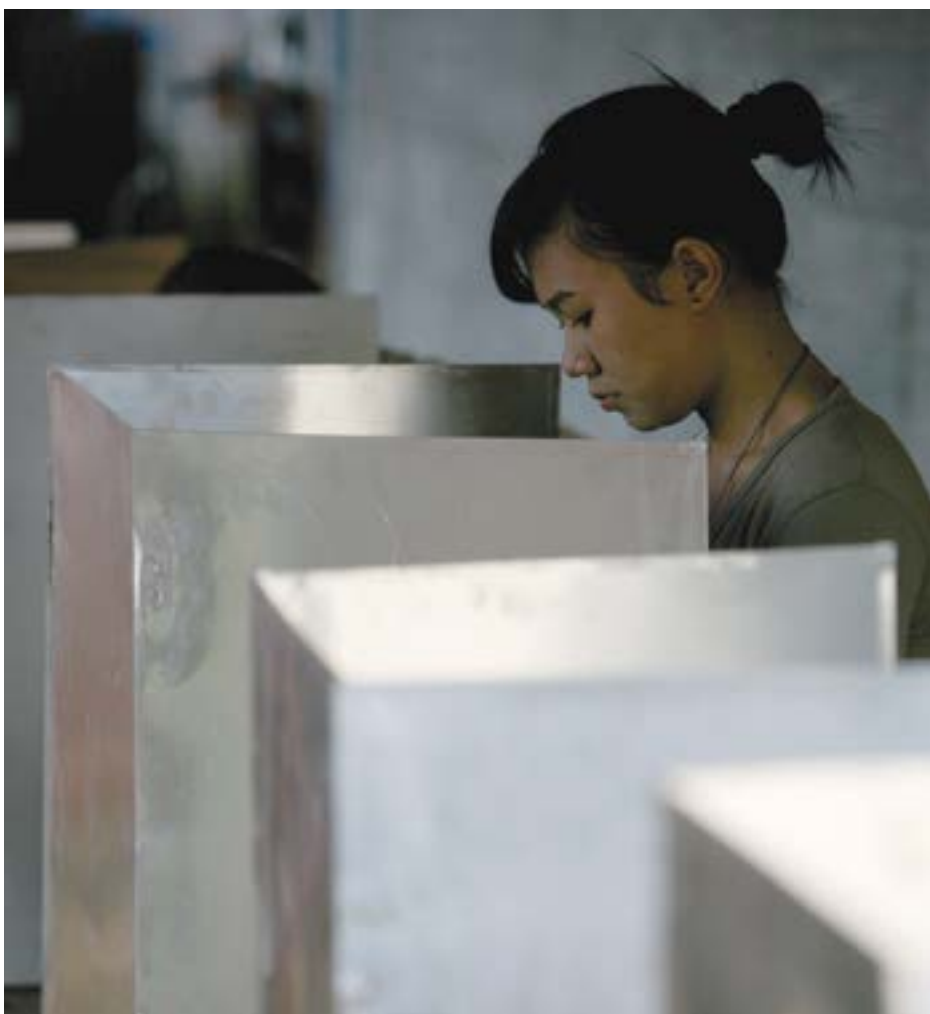
A woman voting in Indonesian elections.