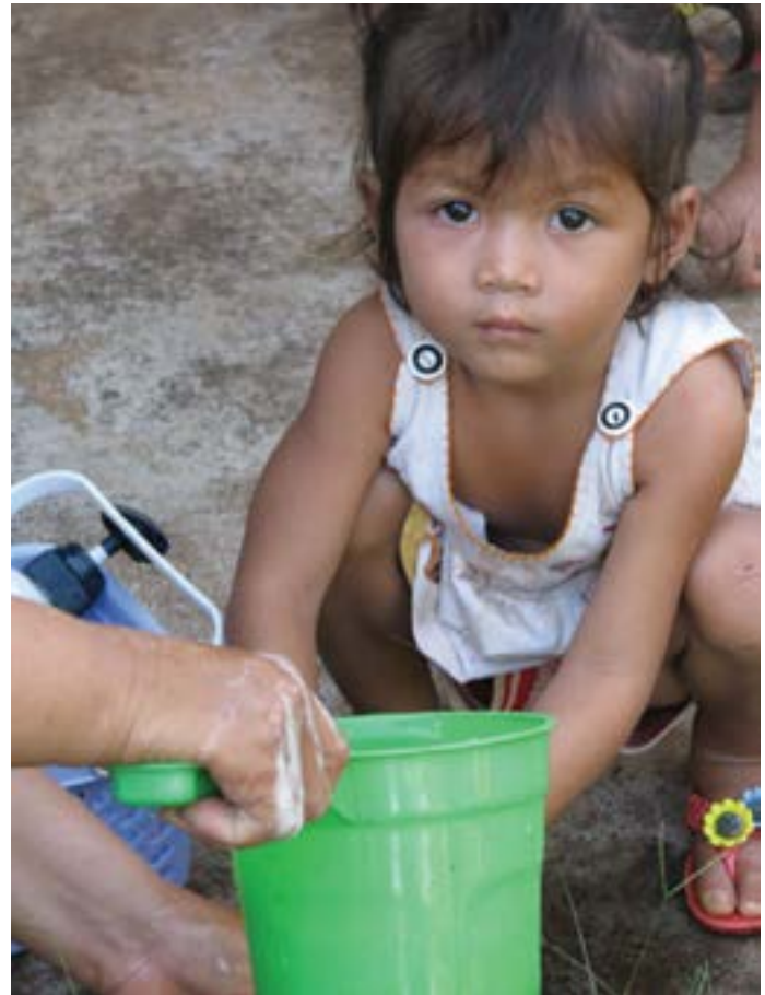
Hygiene lessons at a pre-school in Ratanakiri, Cambodia.

This is indeed a richly rewarding topic, which gives schools the opportunity to delve into a continuing struggle of the human community, and to see how they themselves can respond.