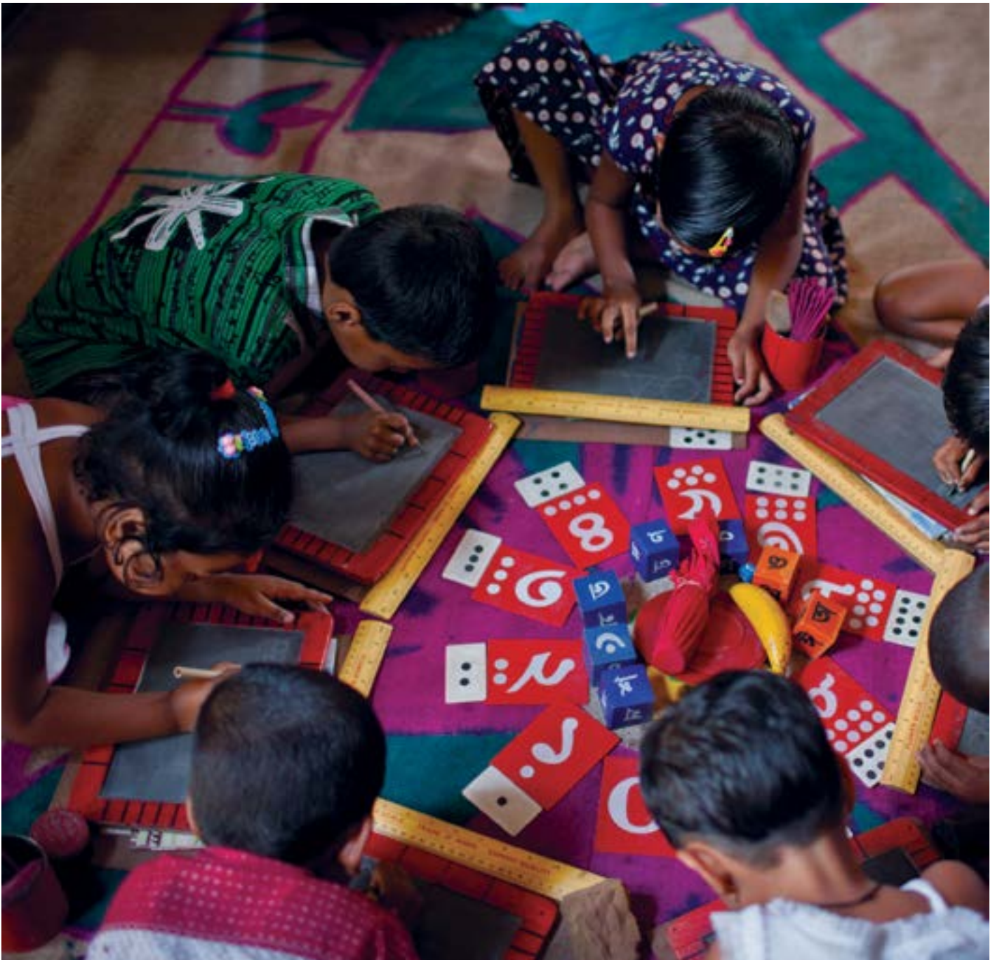
Students at a primary school in Manikganj, Bangladesh.

Building Successful School Partnerships , published online by Oxfam UK, is a very useful guide which covers some of the key questions you need to consider before embarking on a school link. It provides some case studies and ideas which will help you think about the wonderful benefits, and the potential pitfalls, of undertaking overseas partnerships.