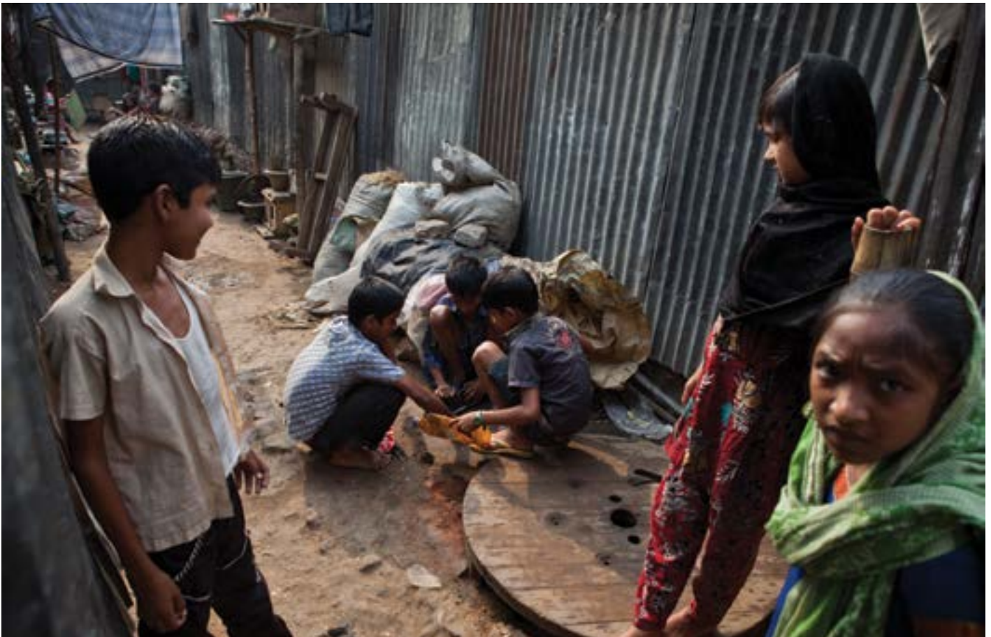
Children play, Koral Slum, Dhaka, Bangladesh.