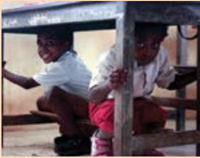
Students take shelter under a desk as part of a disaster simulation at Wadoi Primary School in Nabire District of Papua, Indonesia.

People and communities experiencing poverty are particularly vulnerable to natural disasters – they may be forced to live in areas that are easily flooded, be homeless, living in unsafe housing, have no way of escaping an area in the path of disasters, nor have the money to fund recovery efforts.