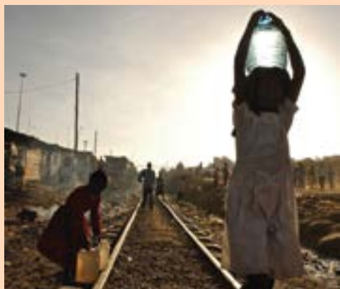
Collecting water in Kibera.

M-Maji is a Swahili word which means ‘mobile water’. It describes a project which aims to provide clean water to people at a fair price, in a place called Kibera in Kenya. Kibera is one of the world’s largest slums, and water is scarce, costly, and often contaminated. Collecting and purchasing the water needed for survival is a daily task that can take hours, especially if accurate information is not available.