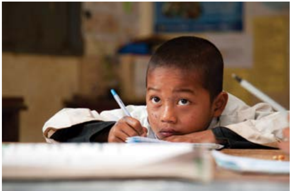
A student at Xayyathong school in Laos.

Below are some suggestions for letter writing activities for students which relate to taking action about poverty, including suggestions for topics to write about, who to write to, and how to go about it.