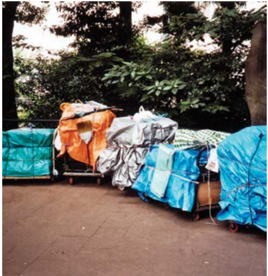
Kate McMillan From the series, Concepts on the verge of collapse 2003, 18 c-type print (series 1 of 2) 18 prints, each print 44.5 x 55cm State Art Collection, Art Gallery of Western Australia © 2013 Kate McMillan.

Students complete this activity by making an entry in their journals "How I feel about poverty." This can be used as a basis for creating their own artworks to communicate their emotional reactions to poverty.