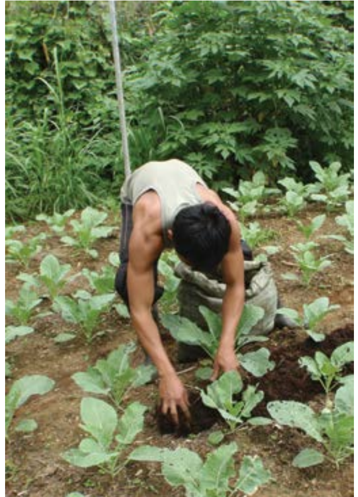
Organic La Top farm in Benguet, Baguio, Philippines