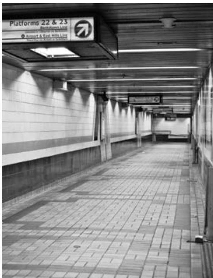
Sometimes people have to sleep on the street or other public places.

The table below shows statistics about homelessness taken from the last three censuses, including information about the number of people living in the different types of circumstances that are considered homelessness. It also shows the Australian population in each of those three years. This information could be presented in a side-by-side column graph, showing change in the various categories of the three years the data was collected. There are also many other ways in which this data could be presented (e.g. three contrasting pie charts).