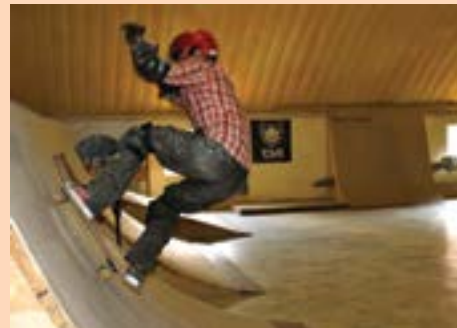
A student at the Skateistan skateboarding school in Kabul, Afghanistan.

Also, look for some background information about Afghanistan from a range of sources. The Global Education website country profile page is a good place to start.