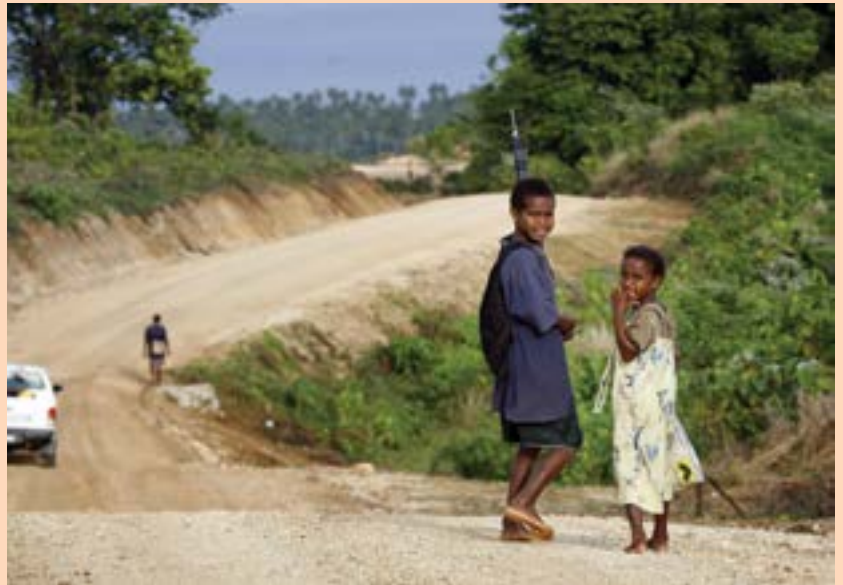
Children in Solomon Islands.

You can find out more about Solomon Islands in the Global education website's country profile .