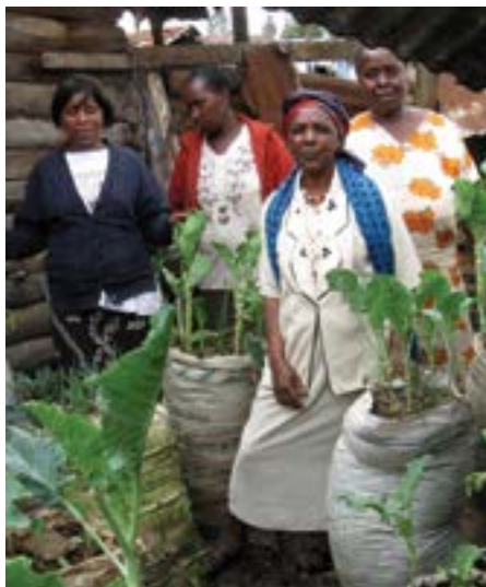
Women in Kibera, Kenya, with their urban gardening project.