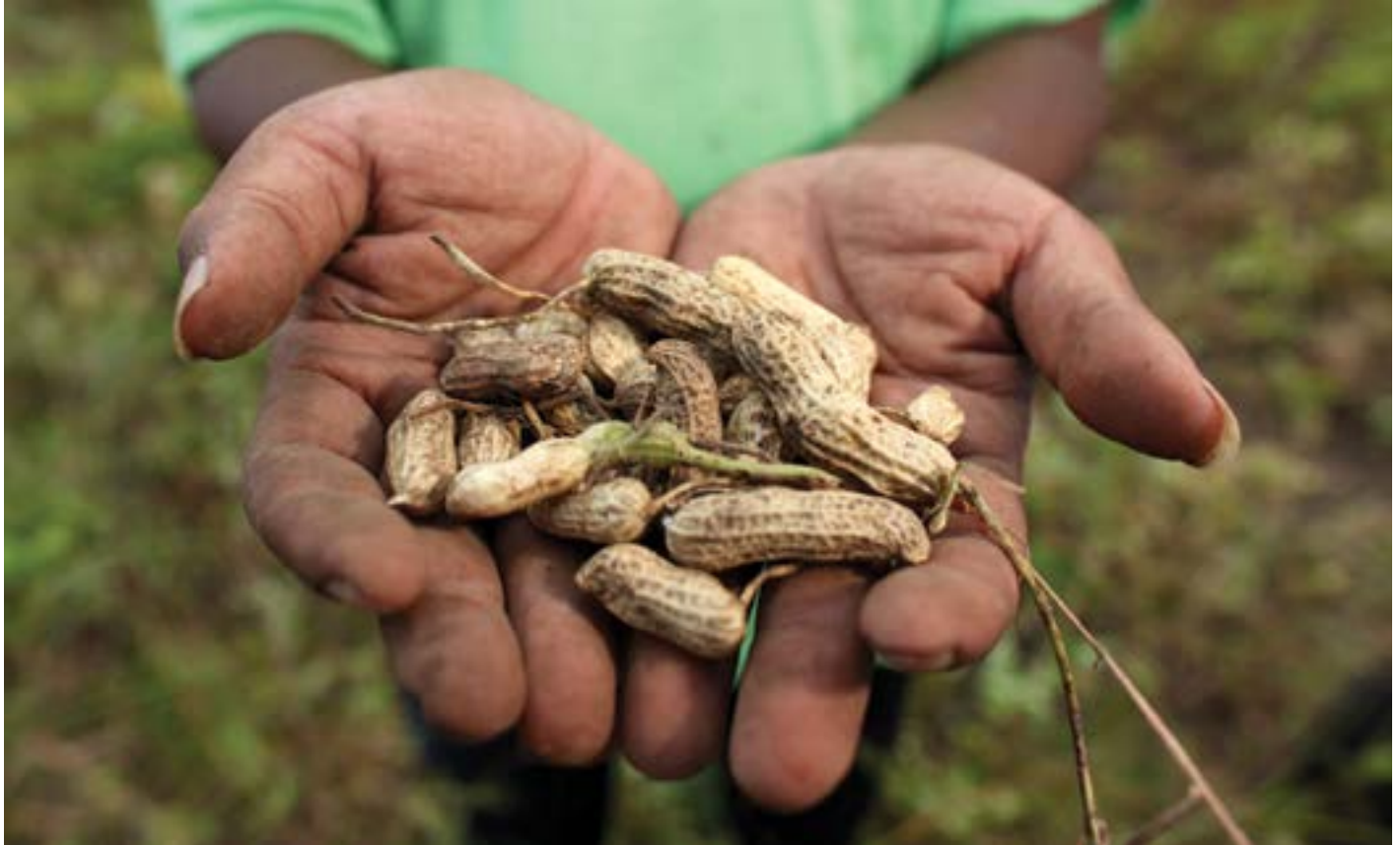
Peanuts from a crop in Lombok, Indonesia.

which everyday actions and circumstances have connections and impacts beyond what we can immediately see.