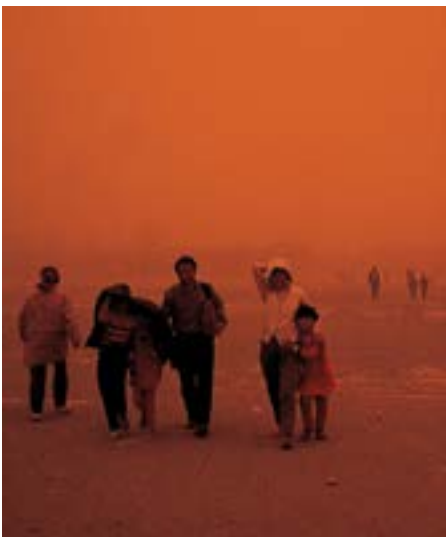
Blowing sand in some parts of China not only decreases visibility in towns and cities but also clogs rivers and water catchments.