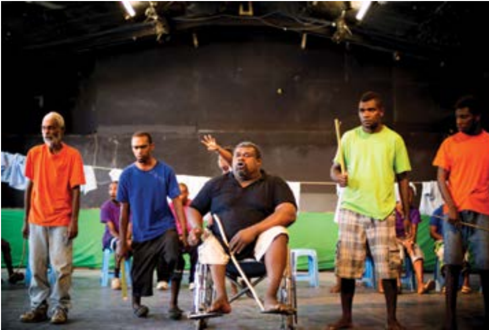
A theatre group perform a play about the daily prejudices faced by people living with a disability at the Wan Smolbag Theatre and Youth Centre in Vanuatu.

As mentioned in the introduction, this publication is structured around an inquiry approach to learning. An important part of this is to enable students to pursue their own lines of inquiry, investigating topics related to poverty that are of interest to and chosen by them. Questions that students have entered into their journals will be a good starting point.