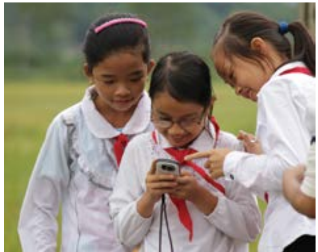
Children in Vietnam taking part in the ChildFund Connect program used hand-held pocket cameras to document their lives, and share with Australian children. The Australian aid supported program encourages dialogue between children in Australia and developing countries using multimedia technologies.

Ask students to start thinking about how they might convince other people to take action on poverty. One way they can do this is through advertising. Tell students that, in small groups, their job will be to create a 30-second commercial that will convince people that they should act to end poverty. (If there are students that strongly believe that people shouldn't act on poverty then they should make a commercial promoting that point of view.) Students will need to write, plan, film and edit their commercial, but first the class should decide on a target audience. They may wish to show their commercials to the rest of the class or to invite in another class or parents or to show them at an assembly. They may even wish to show their commercials online.