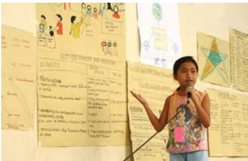
An elementary pupil presents the risk plan developed by her disaster risk reduction school group in Guinobatan Albay, Philippines.