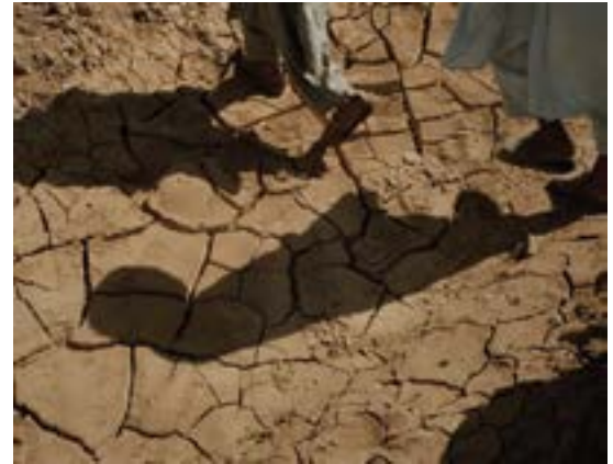
Drought affected area in Mazar, Afghanistan.

The following cards give a brief explanation outlining a range of causes of poverty (they are available to print at the Global Education website ). Divide the class into 12 groups and give each group a different card. You may also use a couple of extra blank cards and record an additional cause suggested by the students in the brainstorm. Students will also need three lengths of wool for each group (you will need at least 36 pieces of wool about six metres long) which they will use in the next part of the activity.