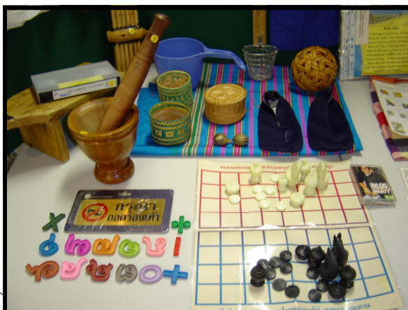
Items found in the Glimpses of Thailand Discovery Box

Students design an alternative for a common piece of technology using a simpler design that would be cheaper and easier to produce.