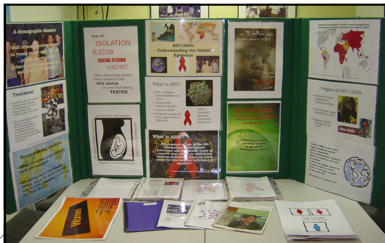
Contents of the HIV/AIDS Display Kit